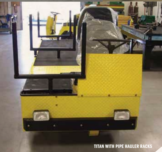
TITAN WITH PIPE HAULER RACKS