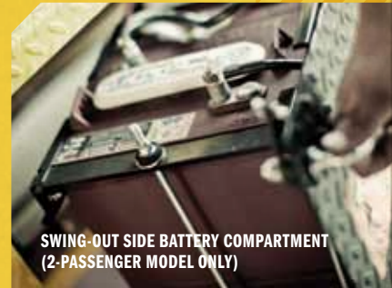
SWING-OUT SIDE BATTERY COMPARTMENT (2-PASSENGER MODEL ONLY)

The Titan features time-tested, unparalleled performance and versatility. Whether you're transporting materials, people or both, this is the vehicle to get the job done.