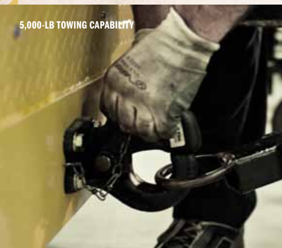
5,000-LB TOWING CAPABILITY