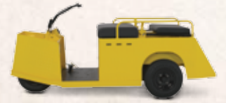
300-LB CARGO DECK

With the Minute Miser, you won't waste a second of your day. This versatile, energy-efficient vehicle is built for efficient transportation, so you can get where you need to go quickly and safely.