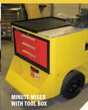
MINUTE MISER WITH TOOL BOX