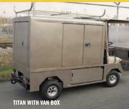
TITAN WITH VAN BOX