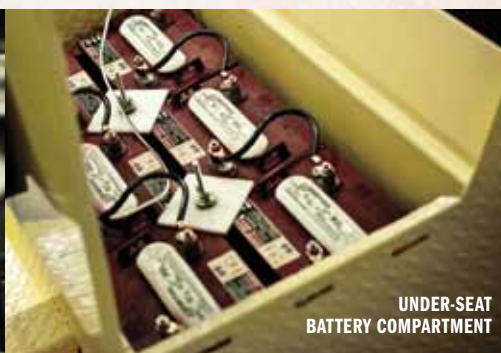
UNDER-SEAT BATTERY COMPARTMENT