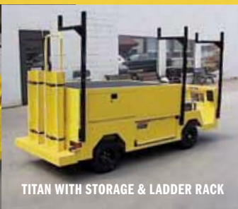
TITAN WITH STORAGE & LADDER RACK