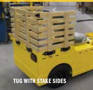
TUG WITH STAKE SIDES